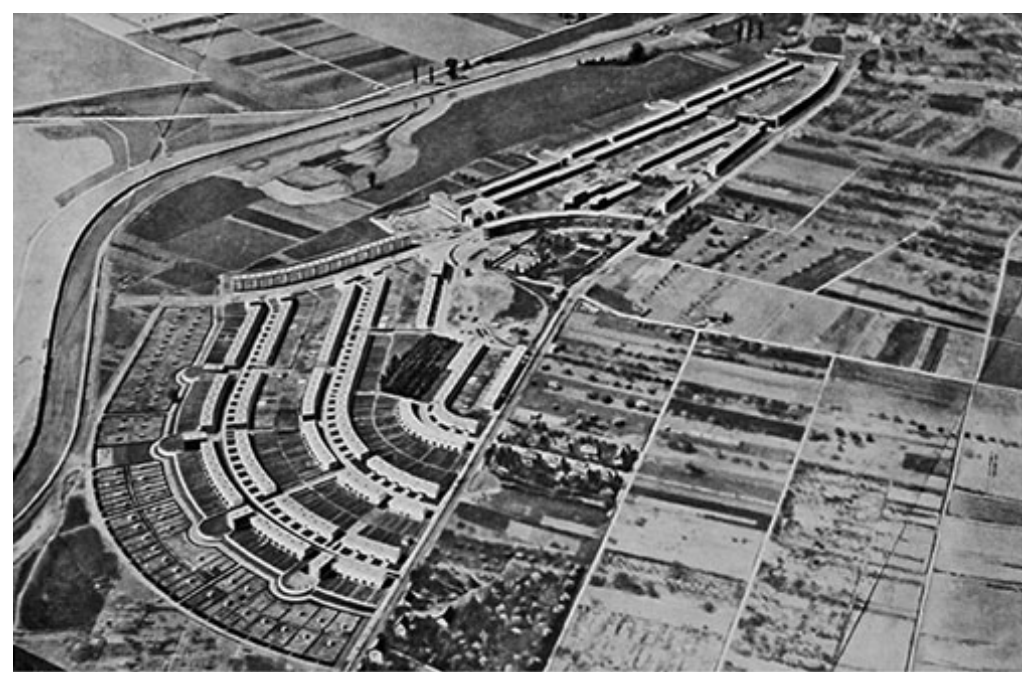
Historica aerial view of the Römerstadt setllement around 1930, ca. 1930

In addition to contributions from architectural history and the field of heritage preservation, the event will also be deepened with positions from art, film and music, and supplemented by student works related to digitization and documentation.